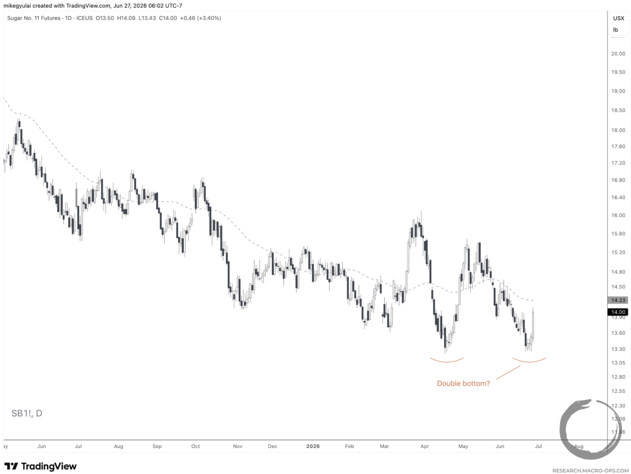
Sugar No. 11 Futures (SB1!), 1D

And Sugar No. 11 Futures could be putting in a double bottom, akin to the price action featured earlier this year in EURAUD.