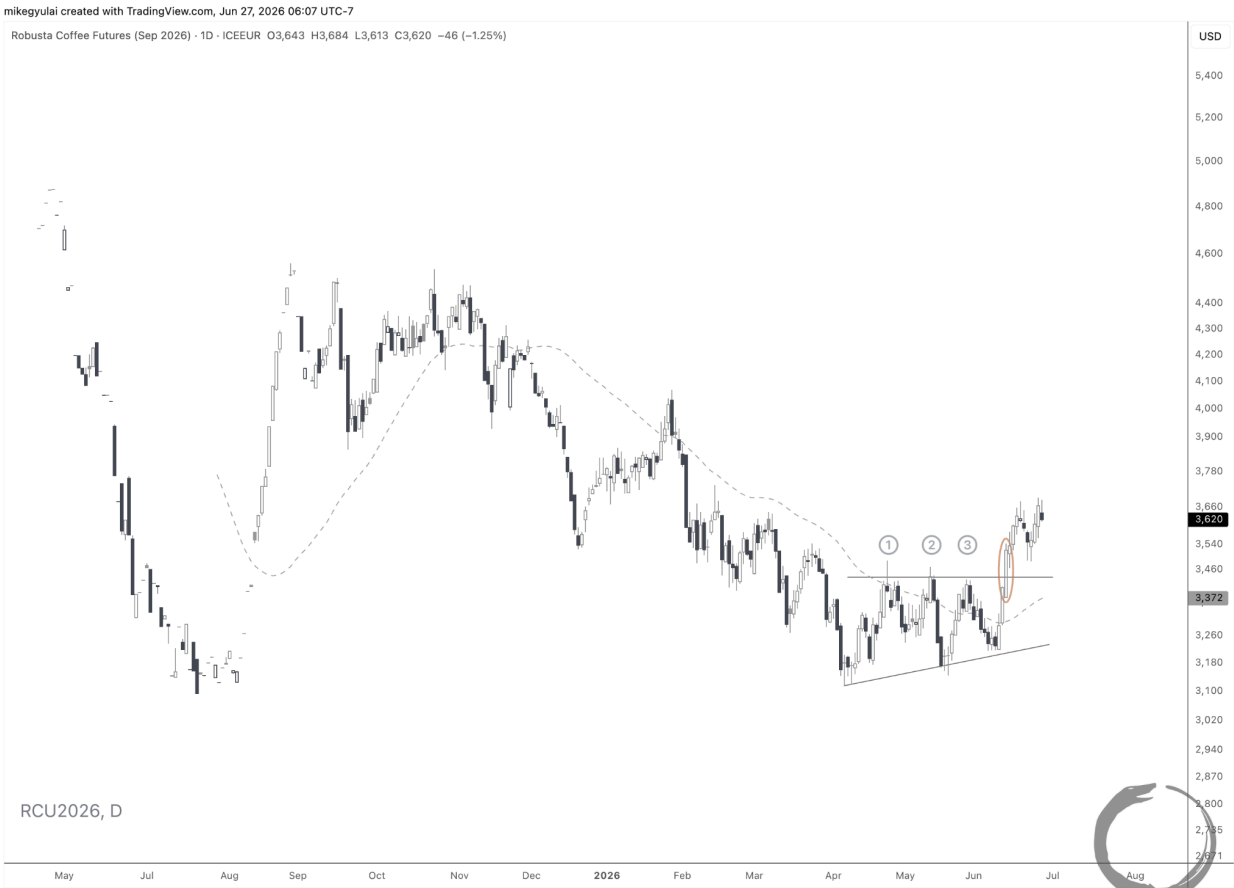
Robusta Coffee Futures (Sep 2026) (RCU2026), 1D

And Robusta Coffee Futures continues to hold the breakout from its Ascending Triangle bottom.