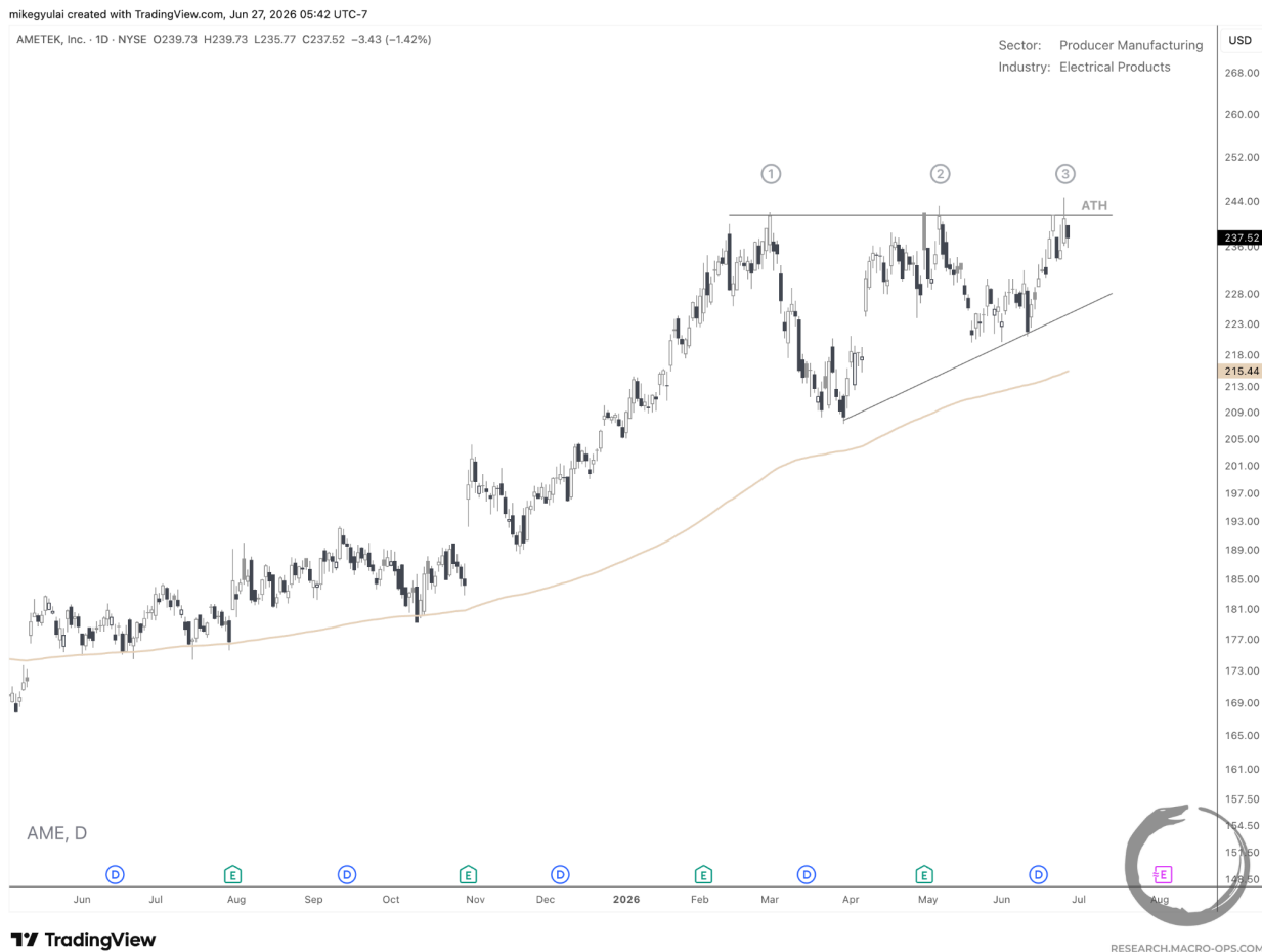
AMETEK (AME), 1D