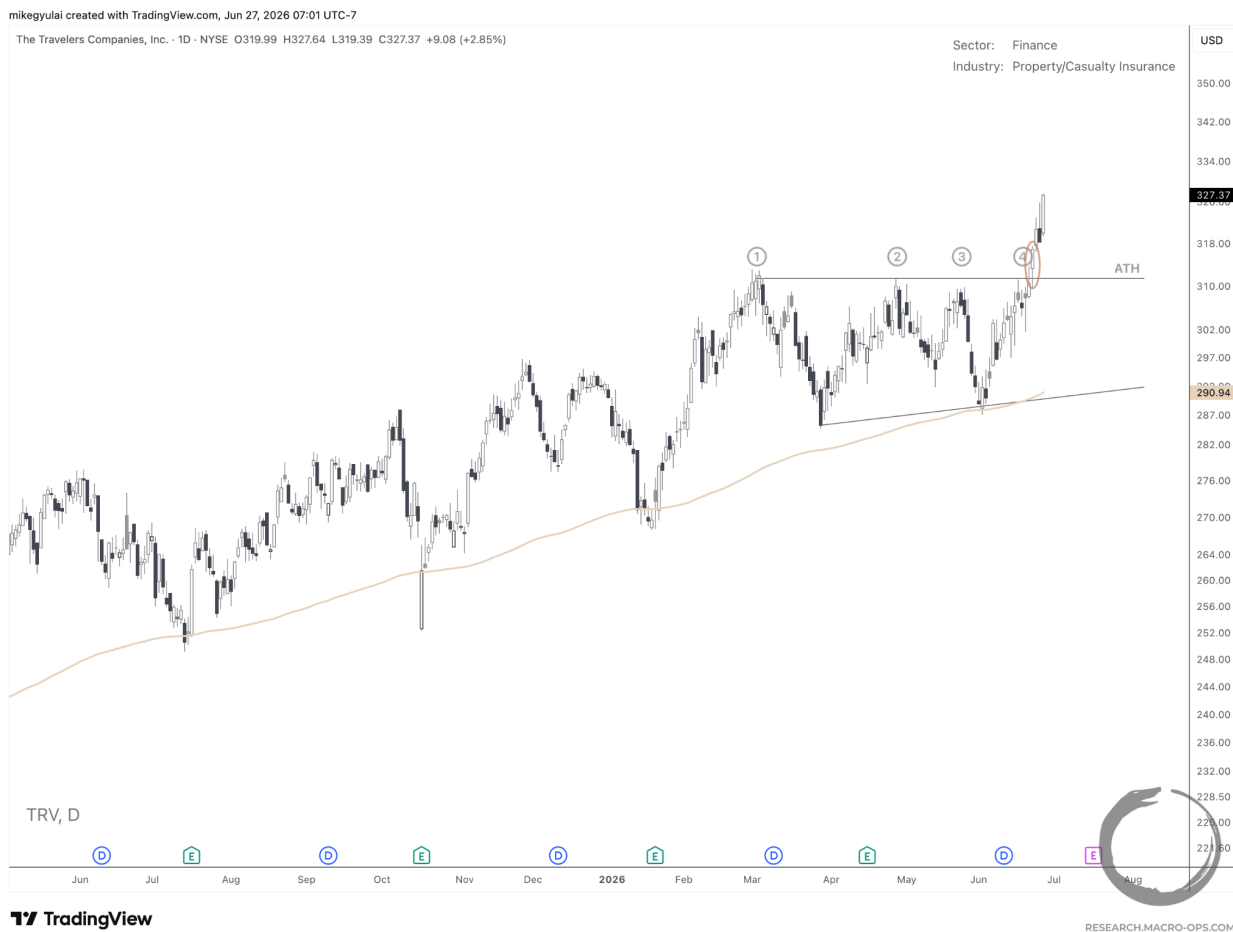
The Travelers Companies (TRV), 1D