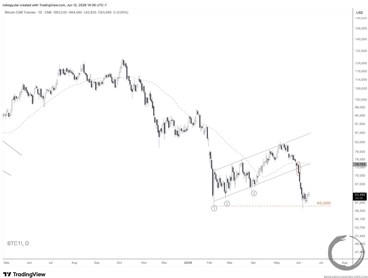
Bitcoin CME Futures (BTC1!), 1D

Price has reached the origin point of the Ascending Channel and we've taken full profits.