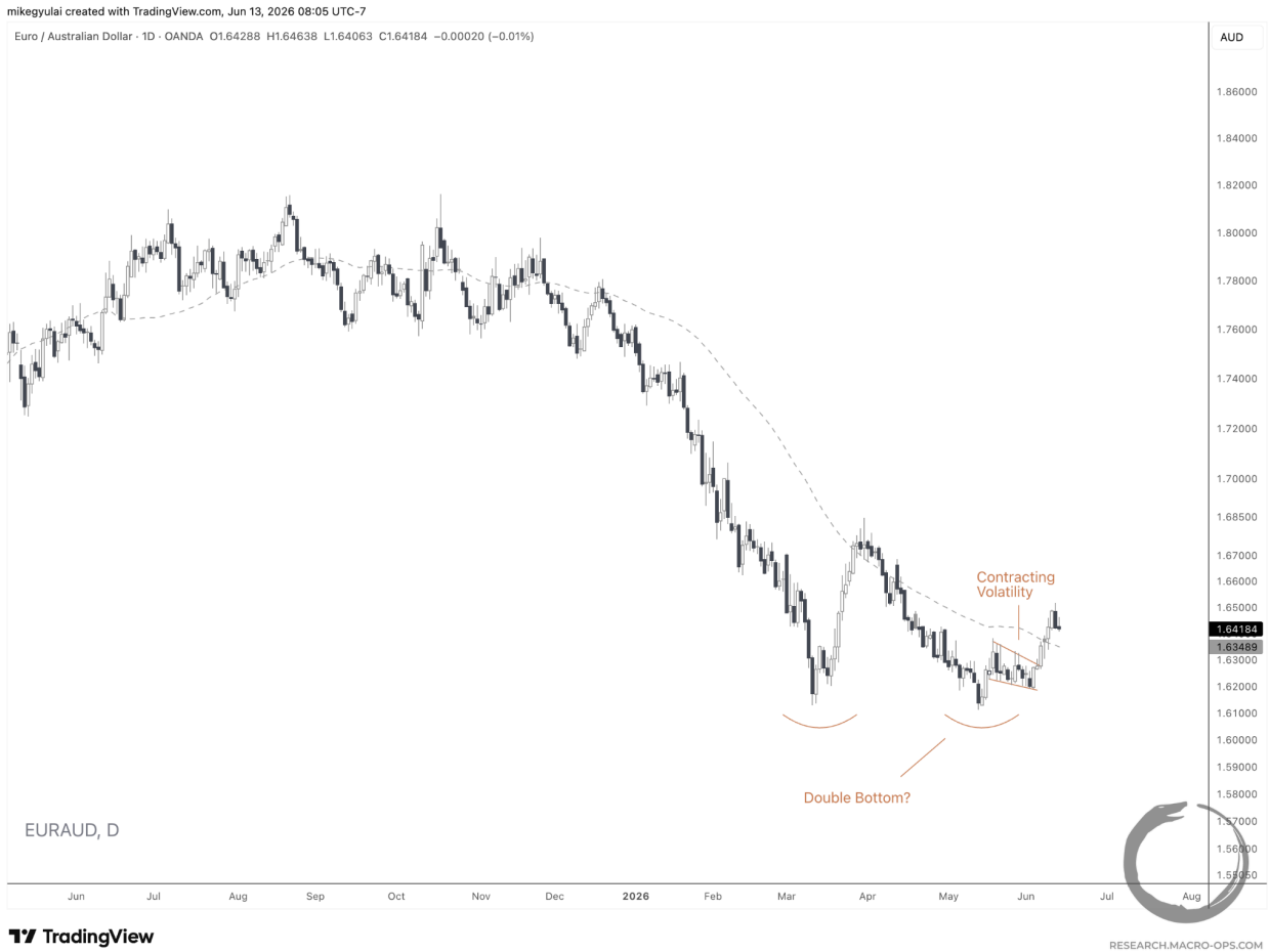
Euro / Australian Dollar (EURAUD), 1D

The contracting volatility in the Euro / Aussie pair, which I noted two weeks ago as a potential sign of a trend shift, expanded to the upside this week. It looks like the turn is in.