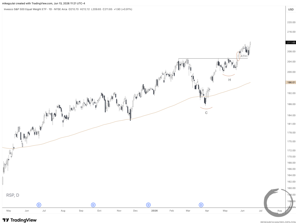
Invesco S&P 500 Equal Weight ETF (RSP), 1D

It has been three weeks since I highlighted the S&P 500 Equal Weight finishing its Cup & Handle Continuation. In the time since, RSP has climbed to fresh all-time highs, even as market-cap weighted indices have retreated from their peaks.