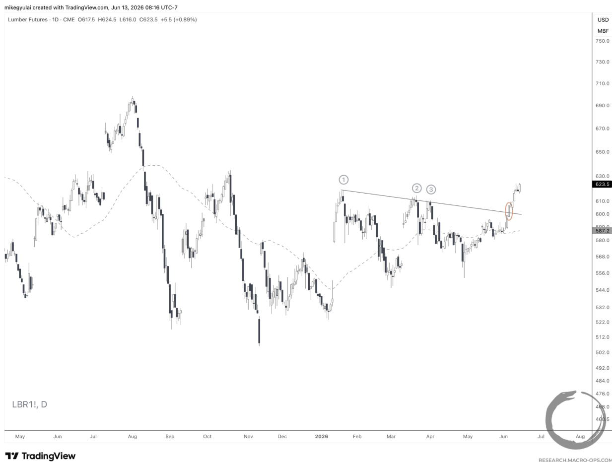
Lumber Futures (LBR1!), 1D

Lumber Futures demonstrated a decisive move within the commodities sector, breaking out cleanly from a multi-point trendline. For more detail on the role trendlines play in commodity technical analysis, refer to Building a Commodities Playbook in the March 21, 2026 edition .