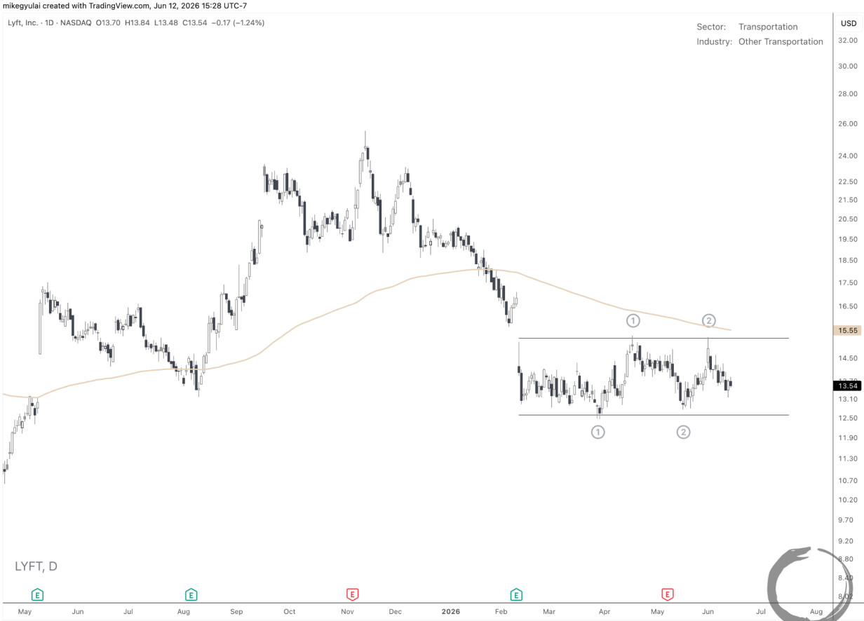
Lyft (LYFT), 1D