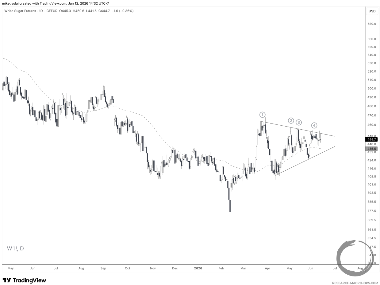
White Sugar Futures (W1!), 1D

And White Sugar Futures are coiling in a Symmetrical Triangle with multiple reactions to the upper boundary.