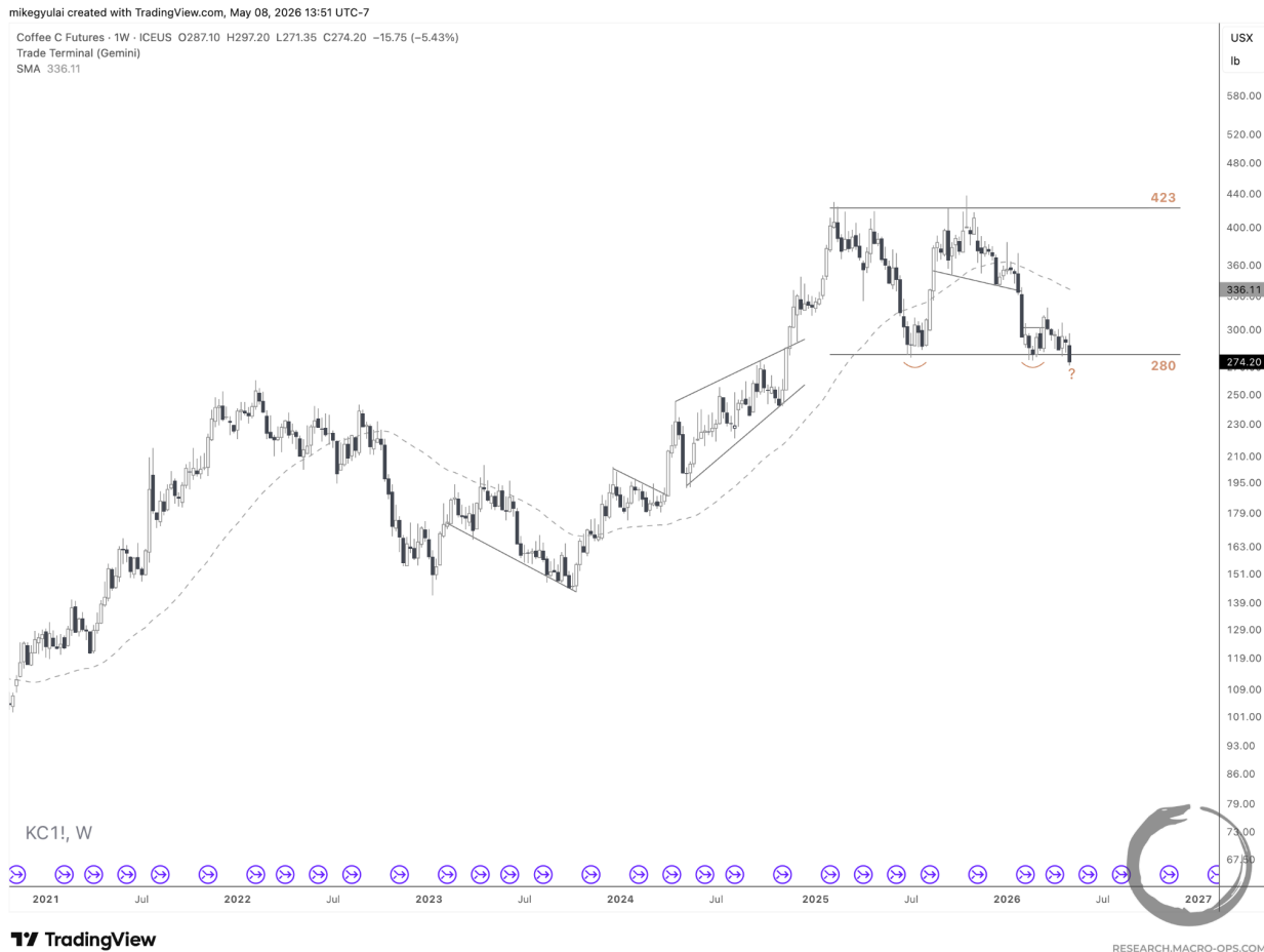
Coffee C Futures (KC1!), 1W

Yet the market now appears on the verge of breaking down.