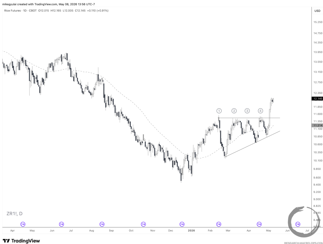
Rice Futures (ZR1!), 1D