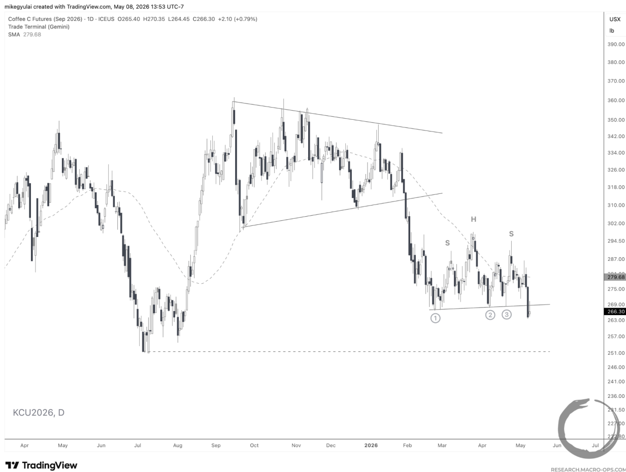
Coffee C Futures (Sep 2026) (KCU2026), 1D

... and a real surprise based on what I was anticipating in Coffee: a Head & Shoulders Continuation to the downside.