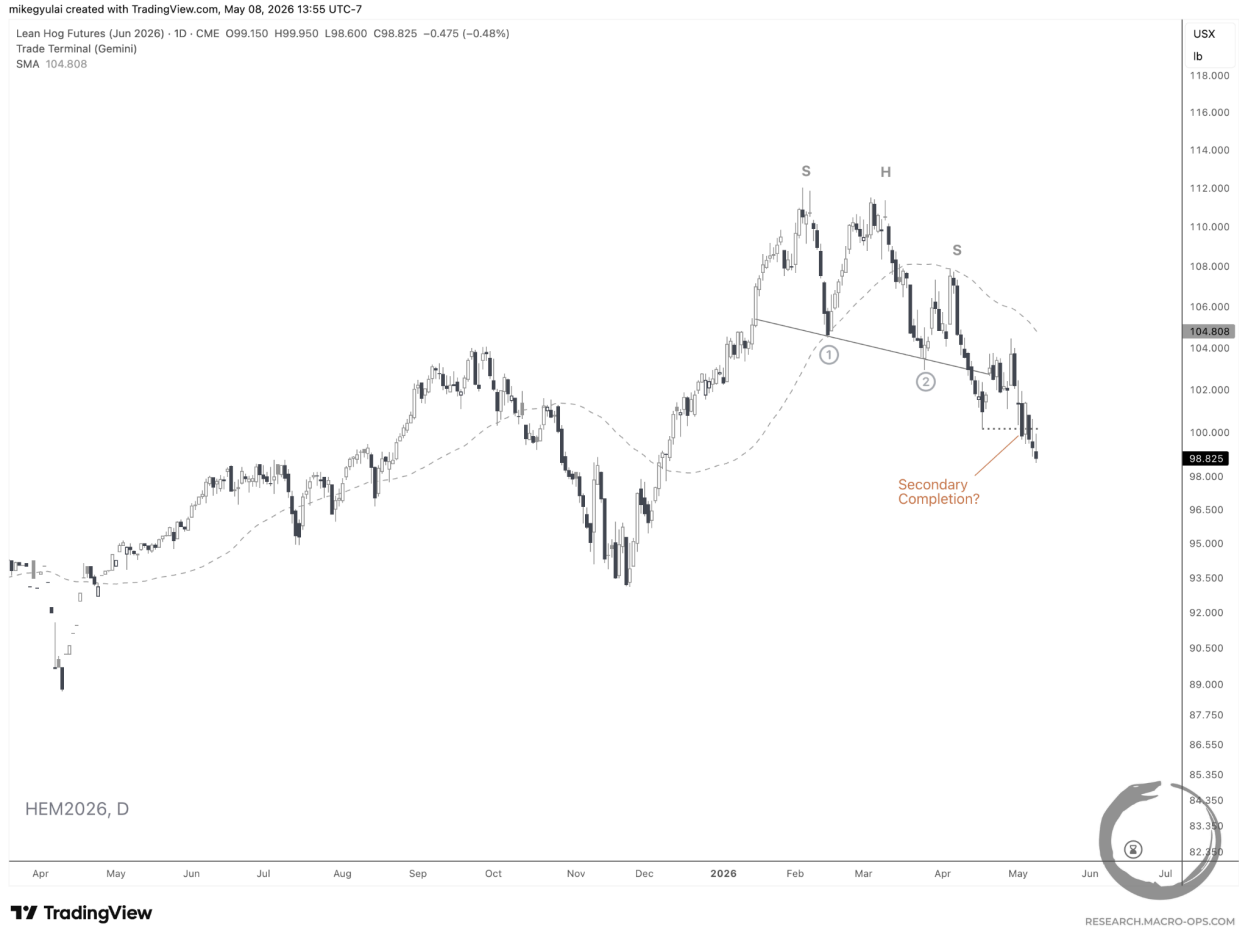
Lean Hog Futures (Jun 2026) (HEM2026), 1D