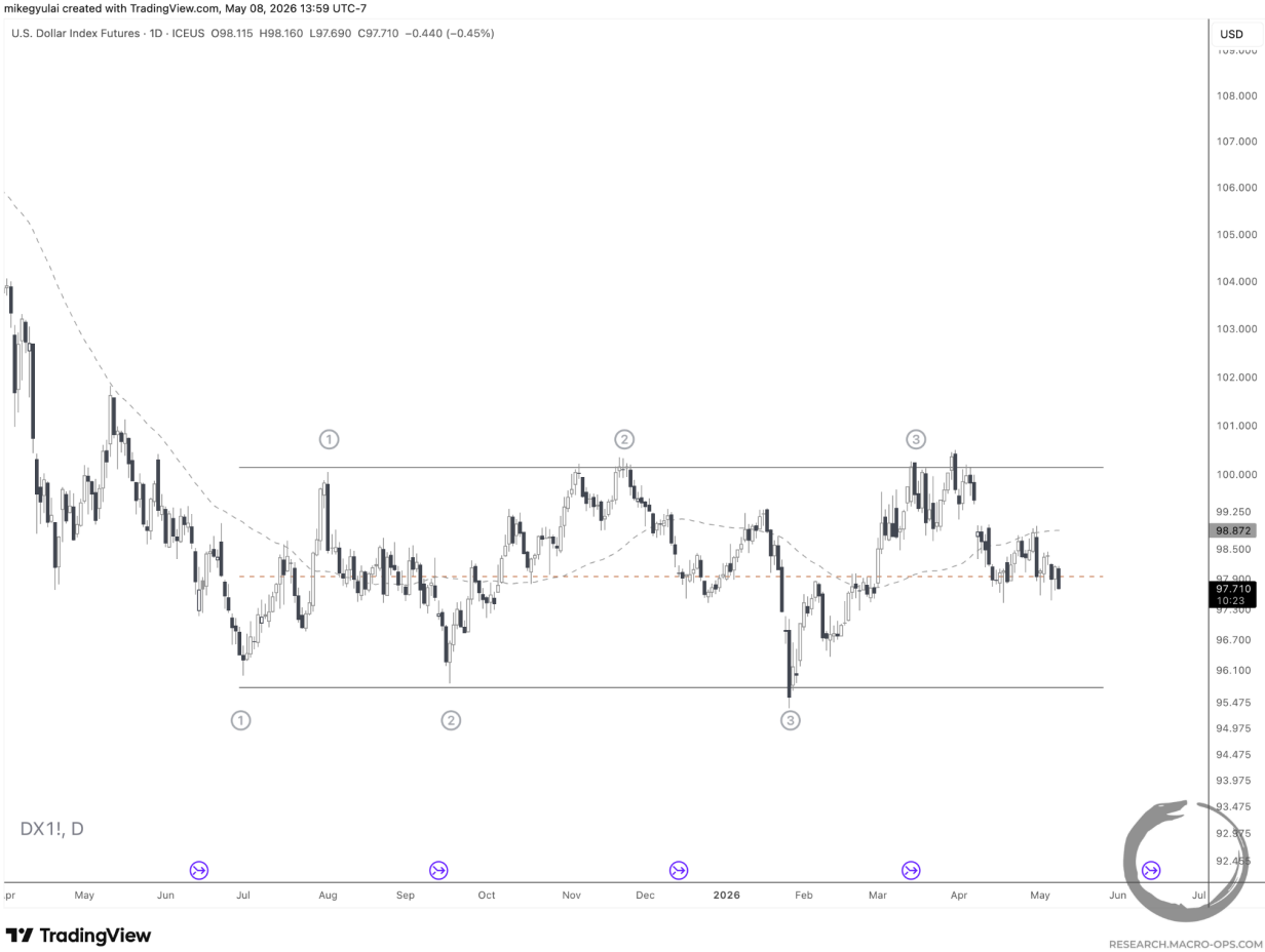
U.S. Dollar Index Futures (DX1!), 1D

The Dollar looking increasingly weak at the mid-point of its range.