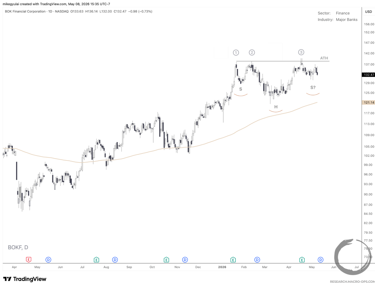
BOK Financial Corporation (BOKF), 1D

Here are the names that caught my attention: