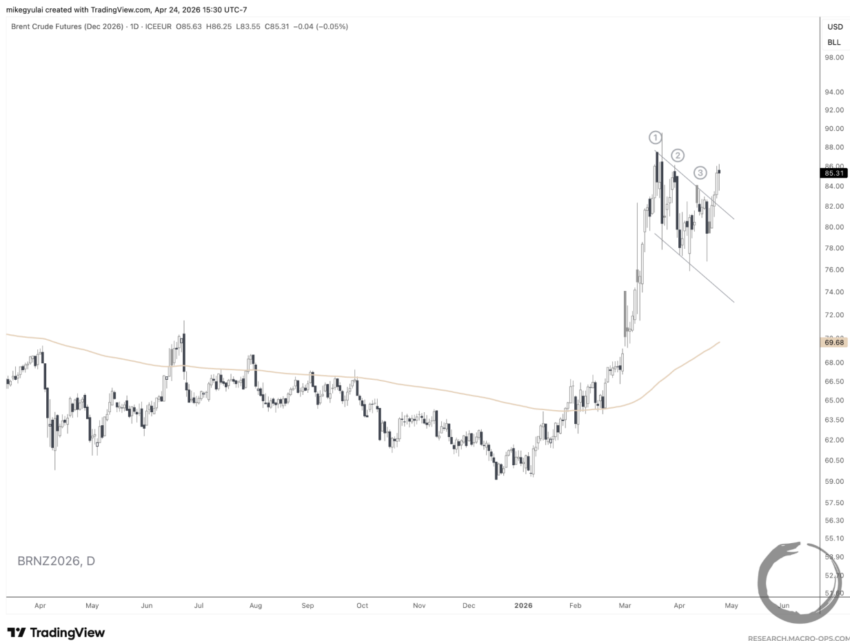
Brent Crude Futures (Dec 2026) (BRNZ2026), 1D

Let's see if they follow through next week.