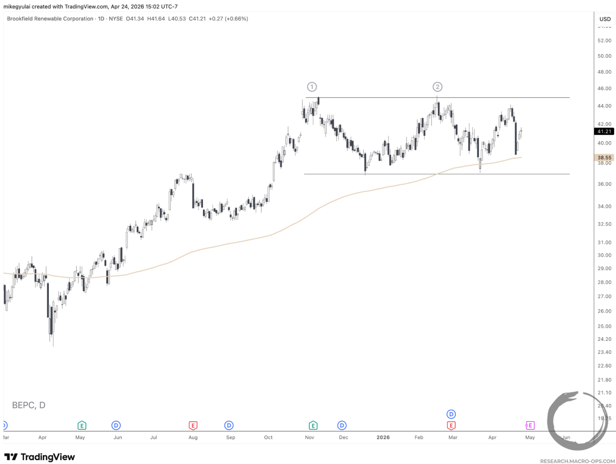
Brookfield Renewable Corporation (BEPC), 1D

Here are the names that caught my attention: