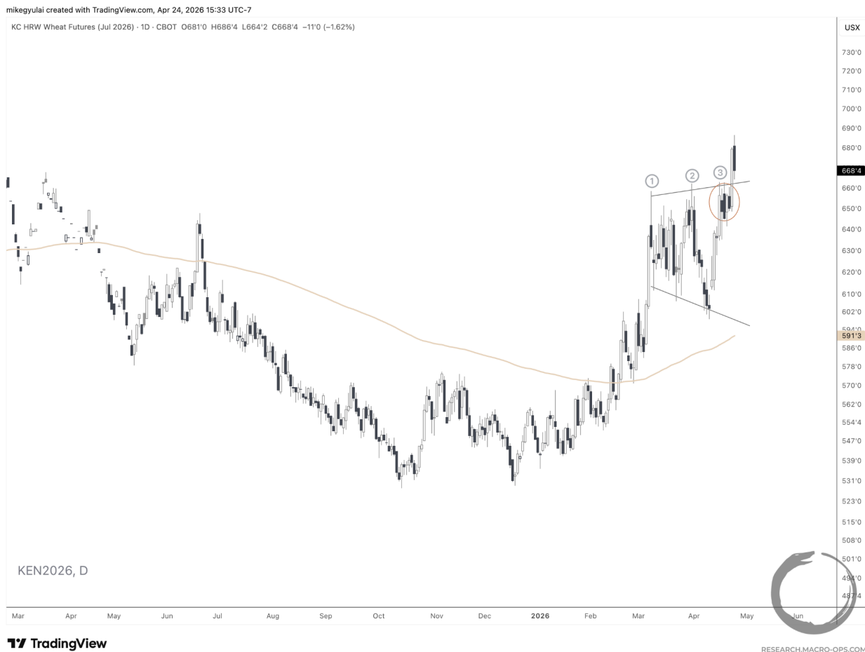
KC HRW Wheat Futures (Jul 2026) (KEN2026), 1D

KC Wheat blasted out of that short price compression on Thursday, but ran into sellers on Friday. Another one to watch for followthrough or lack thereof next week.