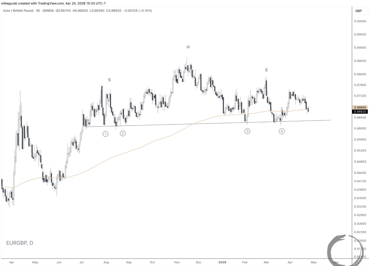
Euro / British Pound (EURGBP), 1D

Euro / Pound could be forming a Head & Shoulders Top, with price drifting back to the neckline: