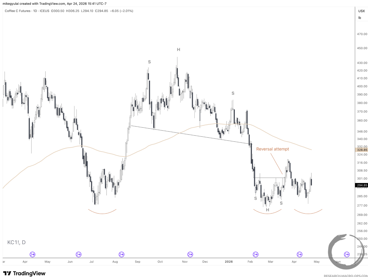
Coffee C Futures (KC1!), 1D

Coffee is at an important juncture. Price is reacting to the ~280 level for the third time in nine months. The last test was March's failed reversal attempt from a 7-week Head & Shoulders Bottom.