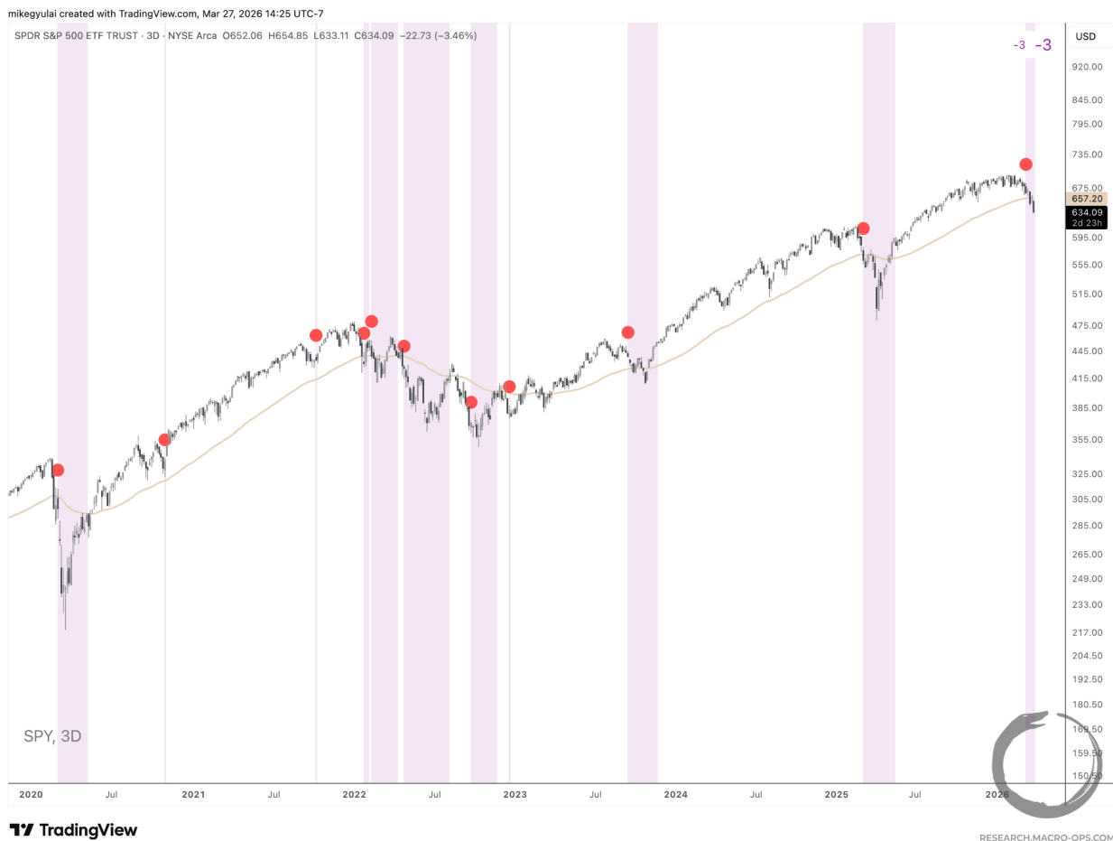
SPDR S&P 500 ETF (SPY), 3D Purple Shaded = Unfavorable Long Equity Breakout Regimes

That Friday, the primary trend filter for my long-equity breakout system flashed risk off. It's remained risk-off since: