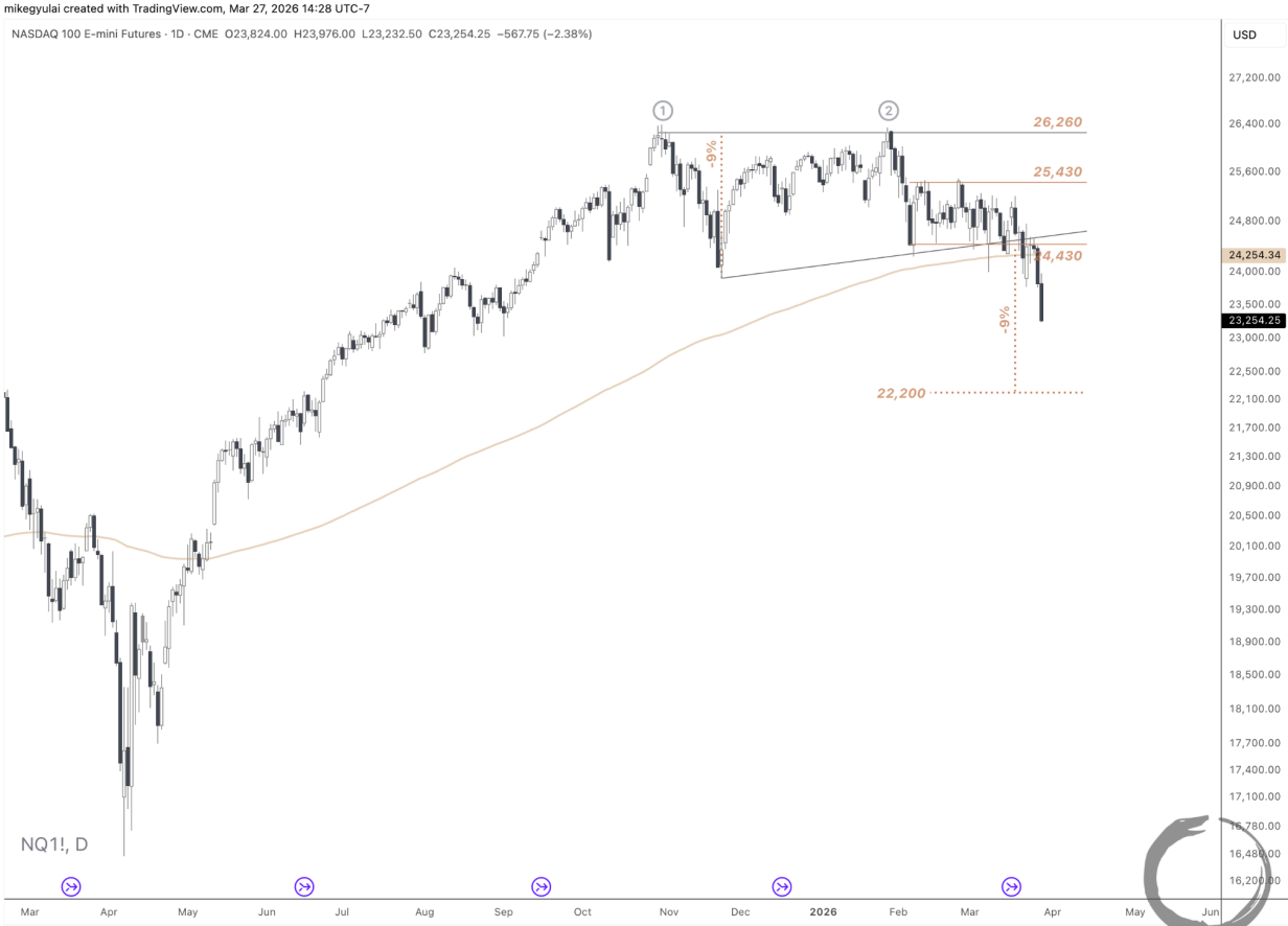
NASDAQ 100 E-mini Futures (NQ1!), 1D

From that same issue, NQ is moving toward its 22,200 measured move target: